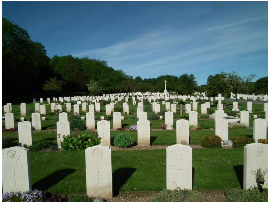
Tidworth Military Cemetery, Wiltshire