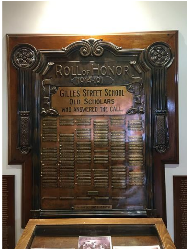
Gilles Street School Roll of Honour